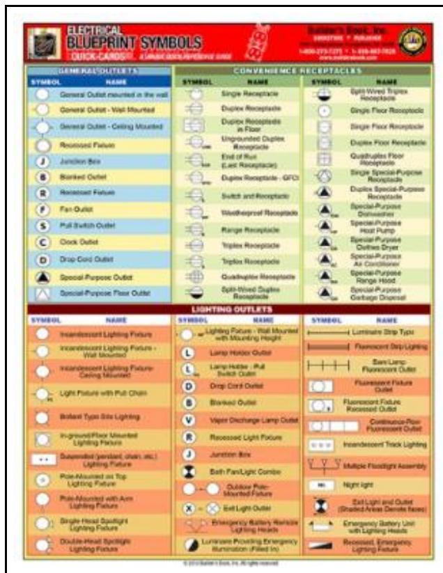
Filesize: 8.97 MB